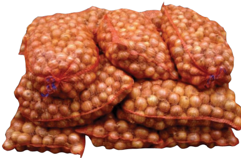
■ Large packaging - PROPER PACKAGING FOR CLASS II