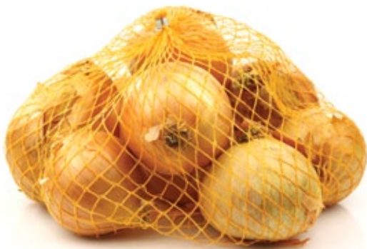
■ Small packaging (1 kg) - PROPER PACKAGING FOR CLASS I